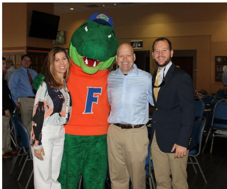
Founder's Day 2016

Join us in Gainesville, April 8, 2017, to celebrate AGR-member historic milestones, honorary brothers and scholarship winners! More details to come.